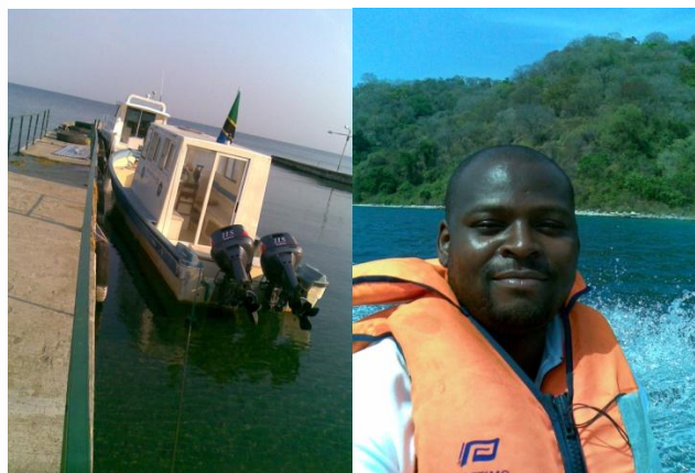
Speed boat @ Mahale N.P