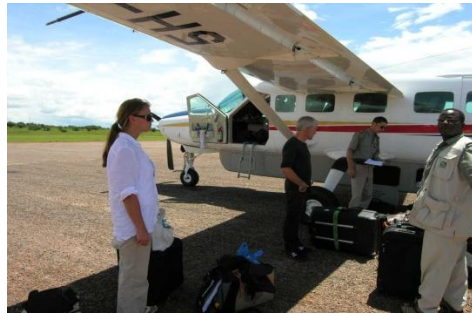
Tourists disembarking @ Mahale Mts. N.P