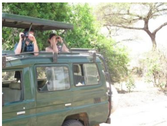
Safari car @ Katavi N.P

Walking safaris, game drives and camping safaris, (wilderness fly camping)