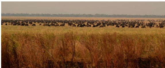
Group of buffaloes at katavi plains