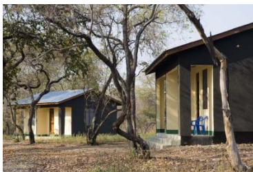
Park bandas at Katavi N.P