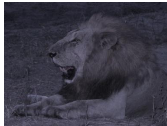
Big male Lion pix recently taken by the M.D