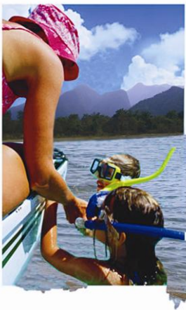
Snorkeling @ Lake Tanganyika waters

Chimps trekking, Hiking, Fly camping safaris, cultural tours, glass bottomed boat rides, snorkeling, scuba diving and sport fishing