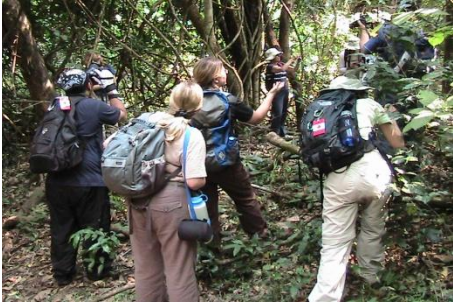
Chimps trekking in Mahale mts. N.P