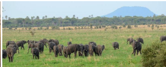
Group of Elephants ( Loxodonta africana ) @ Katavi N.P