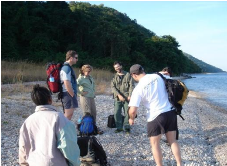
Tourists @ Lake shore after chimp trek in the mts.